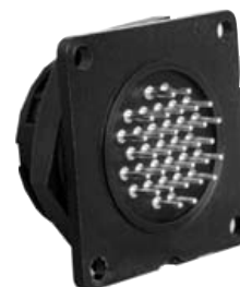
P/C Tail Panel Mount 24XXX-XXXG-XXX Matching Mates: • Cable Pin 23X8X-XXPG-XXX • Cable Socket 23X8X-XXSG-XXX